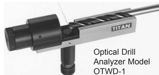
Optical Drill Analyzer Model OTWD-1

For tapered drills it is suggested that they be inserted in a Drill Socket with an internal taper and an external straight shank.