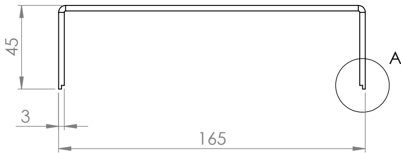
DETAIL A SCALE 1 : 1